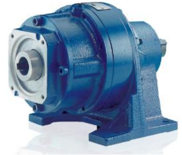
Sumitomo Cyclo Drive

APCO Engineering offers the following industrial reconditioning services: