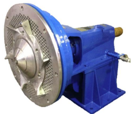
Beloit 28" Shark Pulper