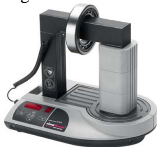
Simatherm IH70 Bearing Heater