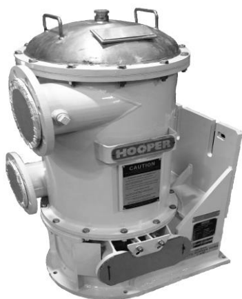
Hooper 18" Rotating Screen

APCO Engineering reconditions industrial mechanical components for a range of industries including, mining and associated processing, paper, power, food and quarrying.