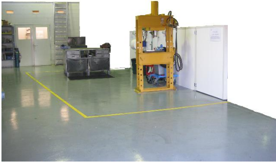
Clean work area

The team at APCO Engineering reconditions industrial mechanical plant including the following components: